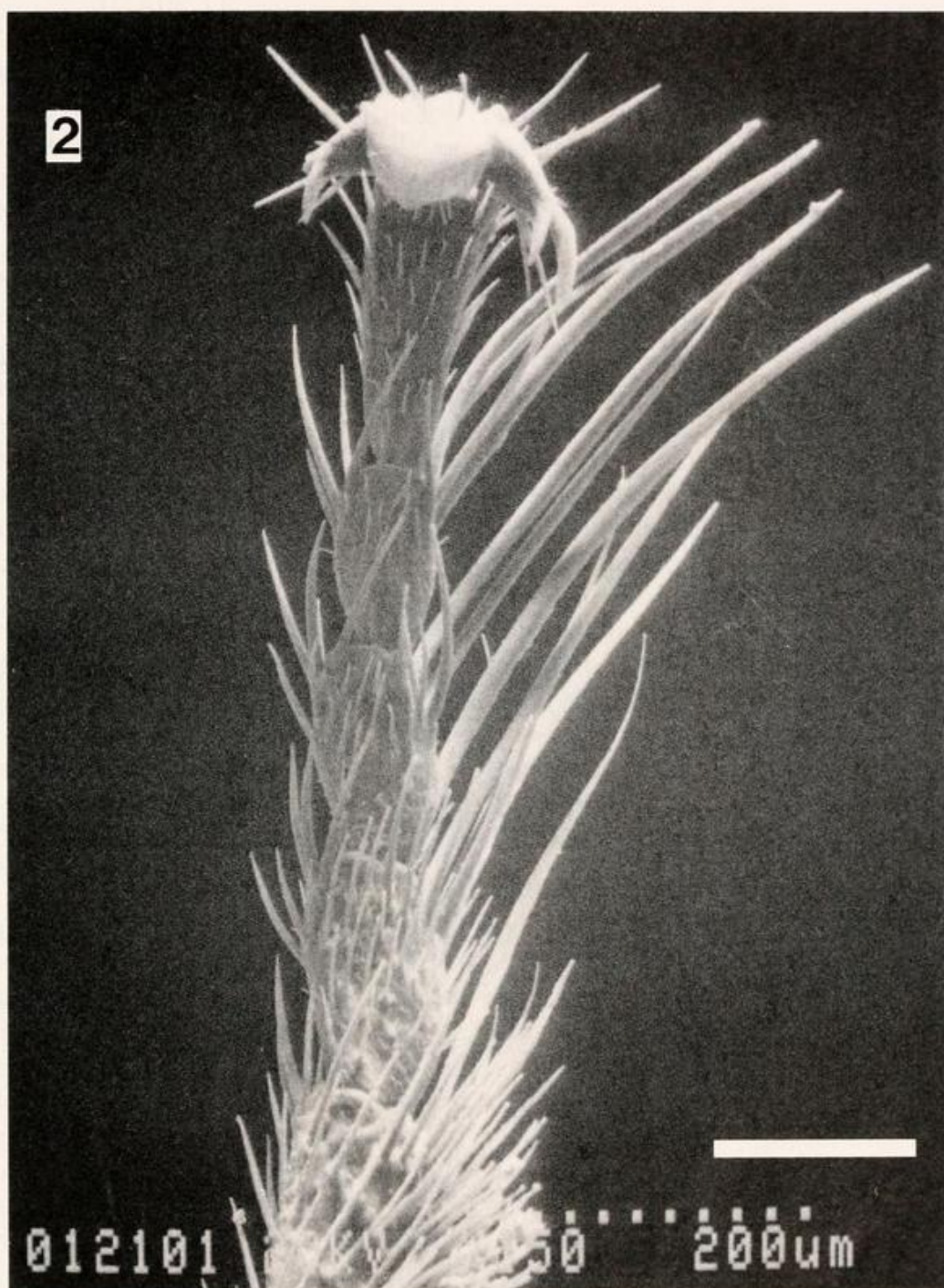
Fig. 2. Mesotarsal rake of female G. longiceps , SEM. Scale line = 0.1mm.

tion of metasoma greater than greatest depth of mesothorax (52:42); dorsal surface of propodeum depressed at base, concave in profile with slight swellings posterolaterally, longer than both metanotum and mesoscutellum (ratio of mesoscutellum:metanotum:dorsal surface of propodeum 11:7:13); legs unmodified other than for long setae on mesotarsus and hind tib-